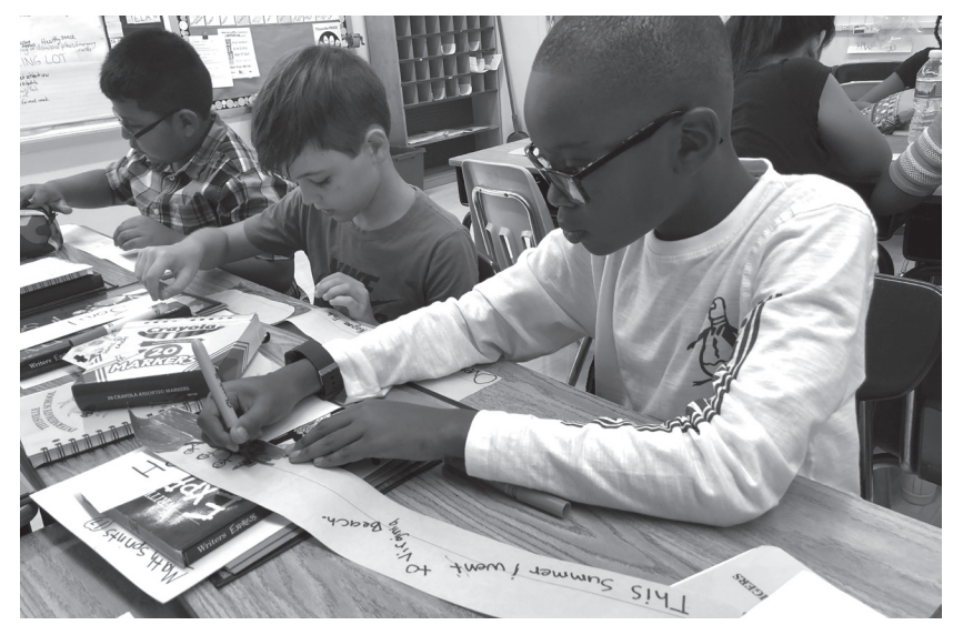
Titusville Intermediate School fourth graders write personal narratives as part of the Teachers College Units of Study writing curriculum.

The goal of the Arlington literacy program is to create flexible, resilient readers and writers who read and write for pleasure as well as for school. Teachers use strategies developed by the Teachers College Reading and Writing Project, along with other resources to help students expand and challenge their literacy skills. •