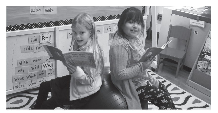
Traver Road Primary second graders practice guided reading in a space that best supports their learning.