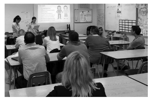
In June, members of the middle school student equity team led a series of teach-ins for faculty and staff.

District administrators and the Board of Education attended workshops to consider what is required of leadership in order to be equitable and inclusive.