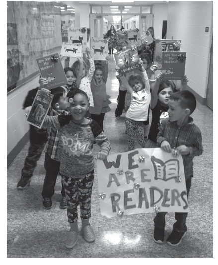
Vail Farm kindergarteners celebrate reading with a "We Are Readers" parade.